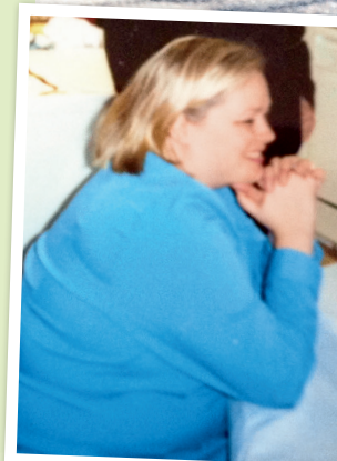
THEN: 225 lbs