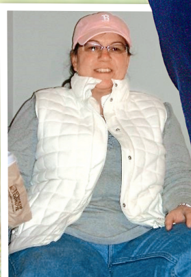
THEN: 211 lbs